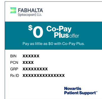
Co-Pay Plus Card

Call your dedicated Novartis Patient Support team to access your Vaccination Card, and learn more about the Co-Pay Plus offer.